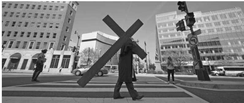
A man carries a cross during a Way of the Cross procession through the streets of Washington on Good Friday, April 14, 2017.

“As a way of overcoming indifference and our pretensions to self-sufficiency, I would invite everyone to live this Lent as an opportunity for engaging in what Benedict XVI called a ‘formation of the heart’ (cf. Deus Caritas Est , 31). A merciful heart does not mean a weak heart. Anyone who wishes to be merciful must have a strong and steadfast heart, closed to the tempter but open to God. A heart which lets itself be pierced by the Spirit so as to bring love along the roads that lead to our brothers and sisters. And, ultimately, a poor heart, one which realizes its own poverty and gives itself freely for others.